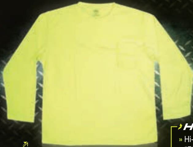
# SS08 - LIME