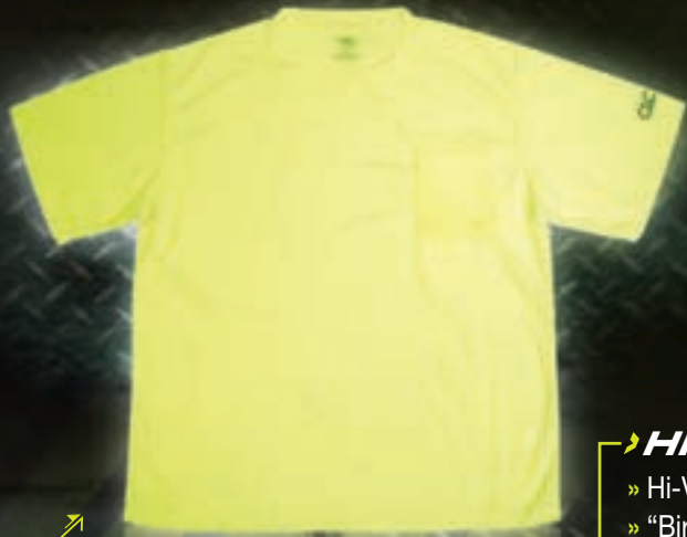
# SS06 - LIME