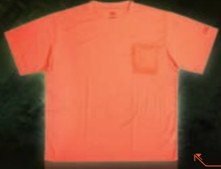
# SS07 - ORANGE