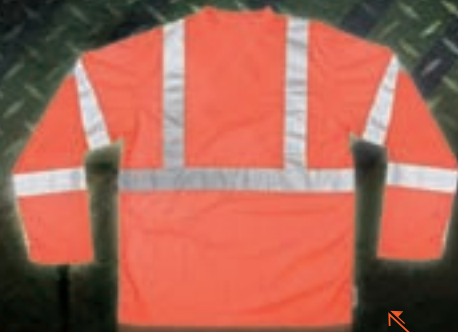
# SS13 - ORANGE