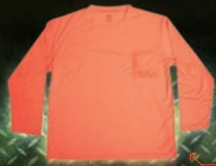
# SS09 - ORANGE