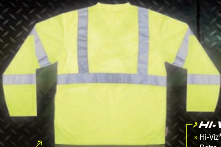
# SS12 - LIME